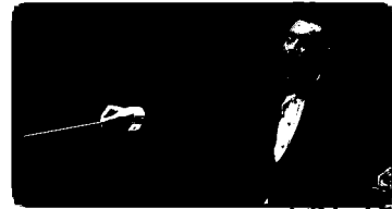
Thanks to the orchestras, conductors and musicians for playing this score and for giving me my inspiration!